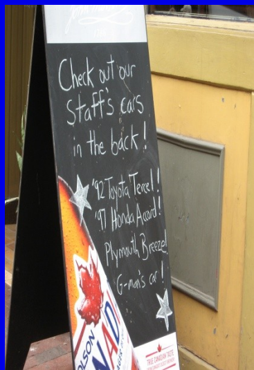
Sign At Mexicali Rosas Moncton Nationals 2008