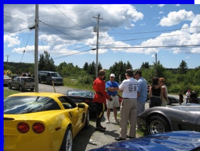
2007 SHEET HARBOUR PARADE

The 1991 ZR1 Callaway Twin Turbo Option cost $33,000